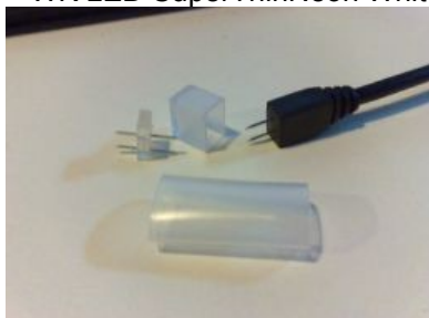
Mounting channel = 8*10mm

Available accessories: Front connectors, Splice connectors, Mounting channels, End caps, Shrinking tube