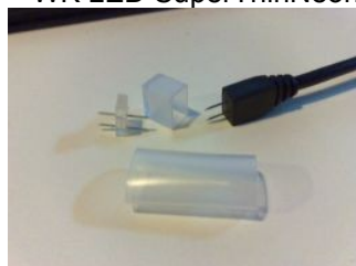
Mounting channel = 8*10mm

Available accessories: Front connectors, Splice connectors, Mounting channels, End caps, Shrinking tube Recommended storage & operating temperature: -20C to 60C, 100% humidity.